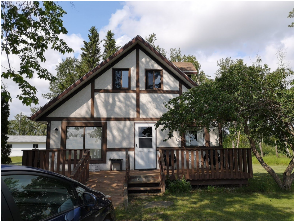
Exterior front with deck