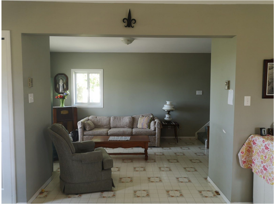
Living Room area off kitchen