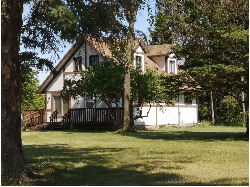
Exterior front and side with deck