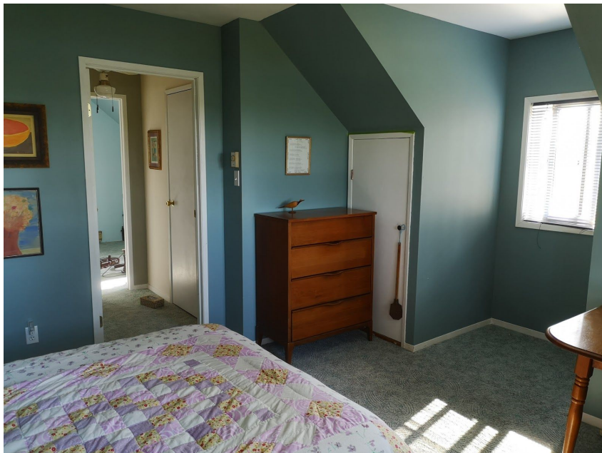
Upstairs bedroom 1