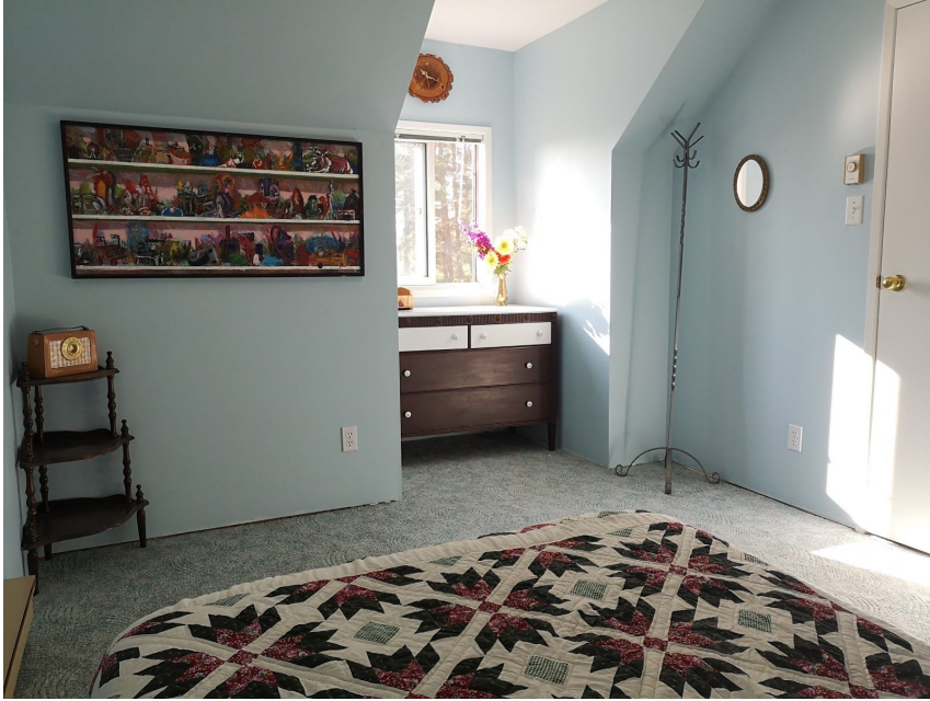
Upstairs bedroom 2