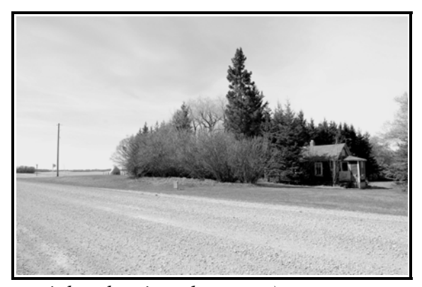
Old Burla Residence, abandoned. (left: close-up, right: showing placement)